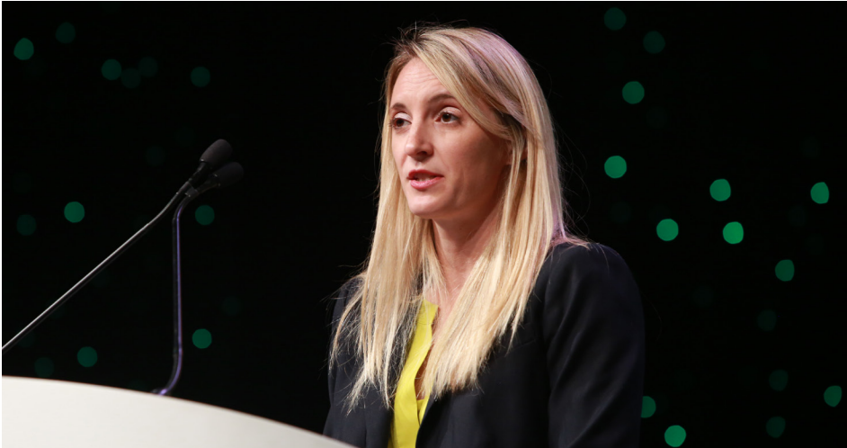
Dr. Daluvoy discusses why she prefers separate procedures in Fuchs' dystrophy and cataract cases.

In the "Global Hot Topics" session of the 2017 Cornea Day at the ASCRS•ASOA Symposium & Congress, presenters discussed ocular surface reconstruction, Zika virus and the eye, the Asia Cornea Society Infectious Keratitis Study, management of bilateral limbal stem cell deficiency, addressing corneal blindness, global eye bank development, bioengineered corneas, transplantation of ex vivo expanded human corneal endothelial cells, producing corneal cells from induced pluripotent stem cells (iPS), and using long-term preserved corneas for DALK.