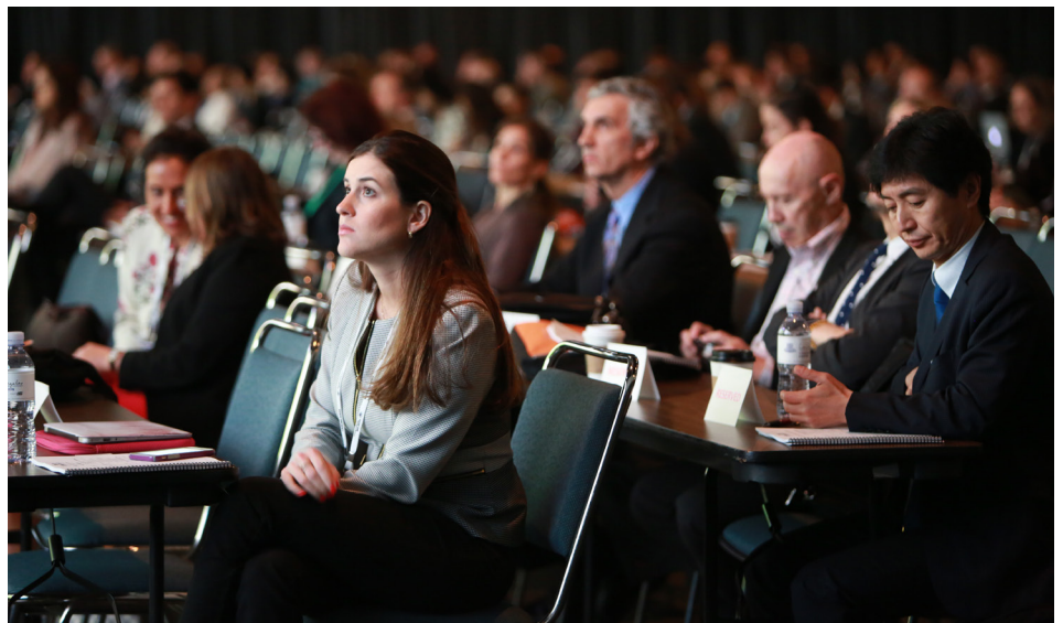
Attendees at the 2017 Cornea Day in Los Angeles