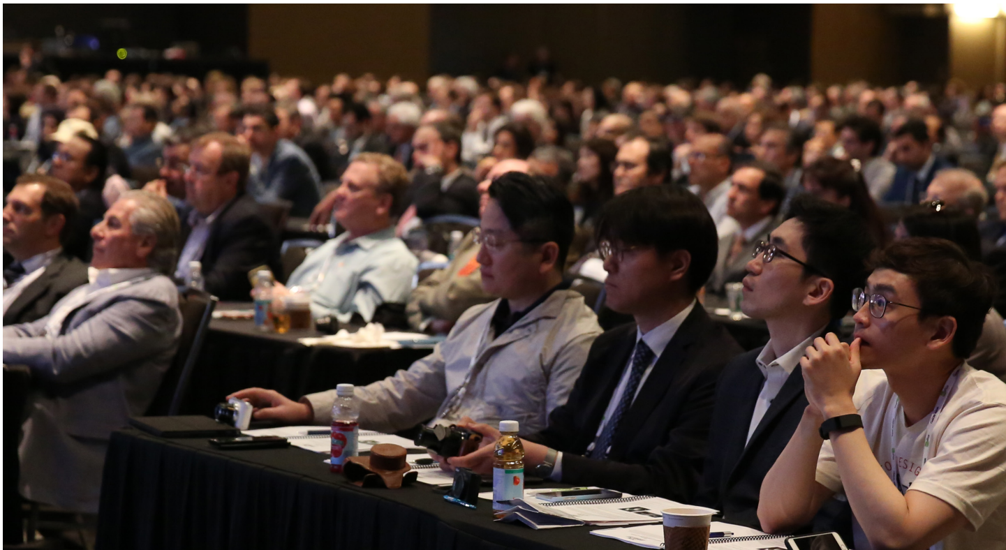
Attendees of the 2016 Cornea Day at the ASCRS•ASOA Symposium &amp; Congress

Dr. Hammersmith's presentation focused on a 43-year-old with HSV, and she offered information on some of the tools that surgeons can use to address these cases. Possible options include steroids, anti-VEGFs, argon laser, and diathermy cautery. Steroids are widely used and probably the most common treatment, but physicians may want to have other options as well.